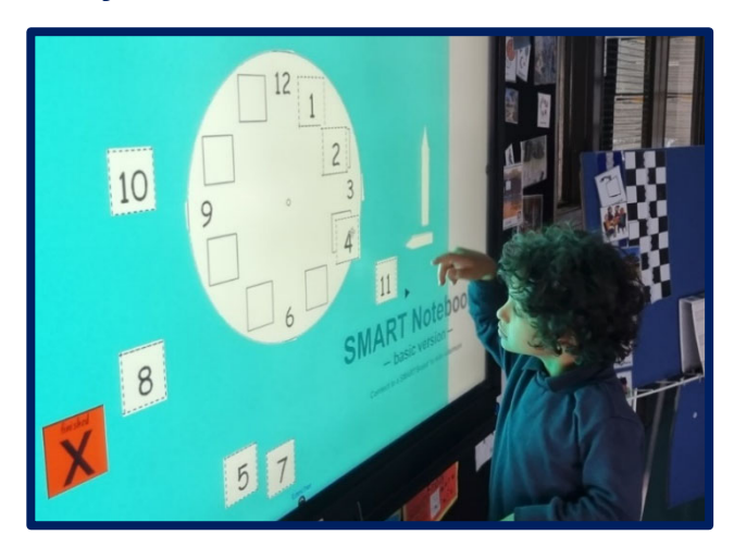
Anthony placing the numbers in the correct positions on an analogue clock face