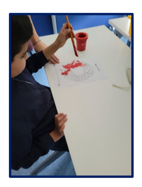
Hussain painting a wreath