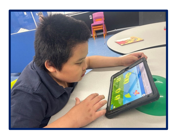
William completed number activities on the iPad during mathematics