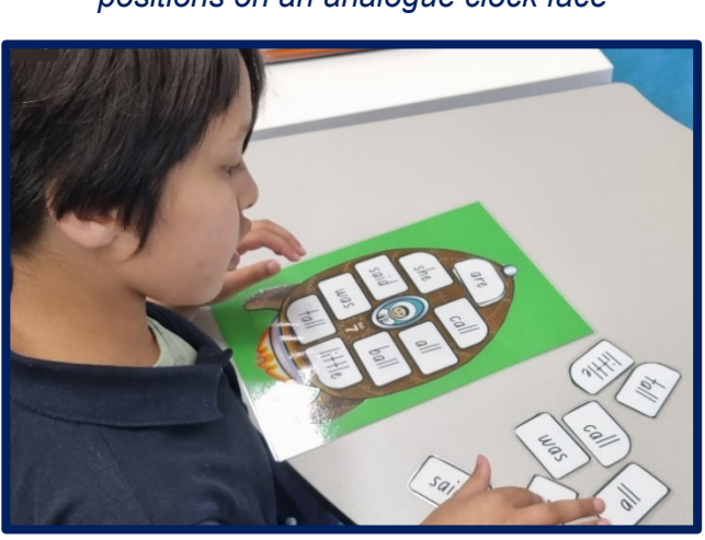
Nehan matches and identifies some 'tricky' words