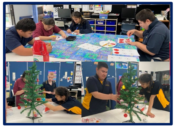
Students working together, painting poppies for Remembrance Day, and decorating the Christmas tree