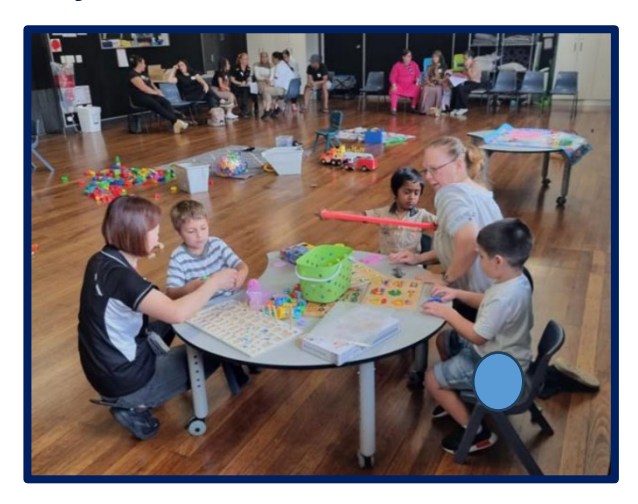
Our new students explore some activities at the