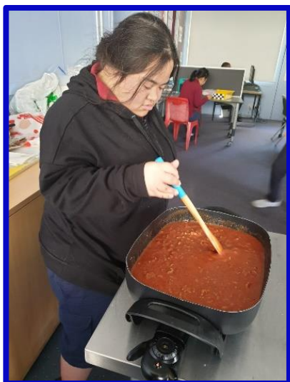
Petina cooking up a storm