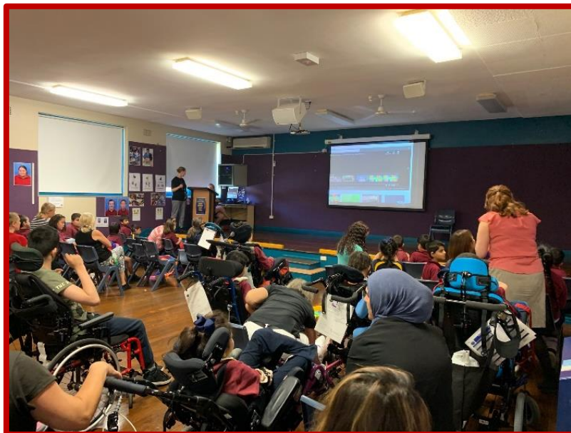
Students performing 'We Are'