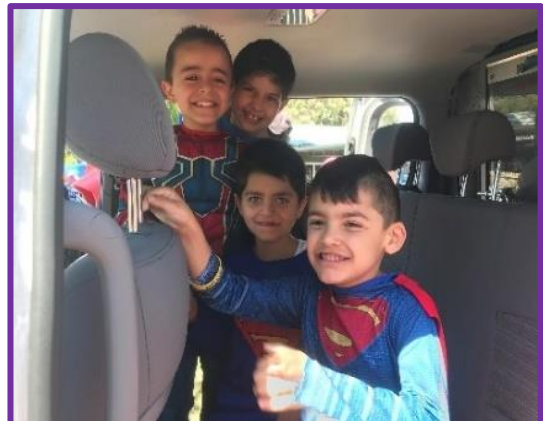
Some of the boys loving being in a police car