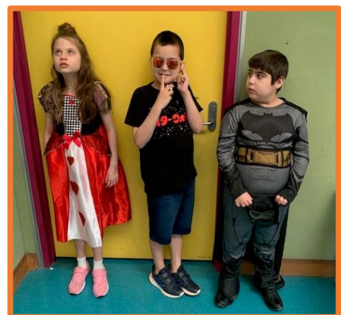
Bear Class all dressed up for the Caroline Chisholm Disco