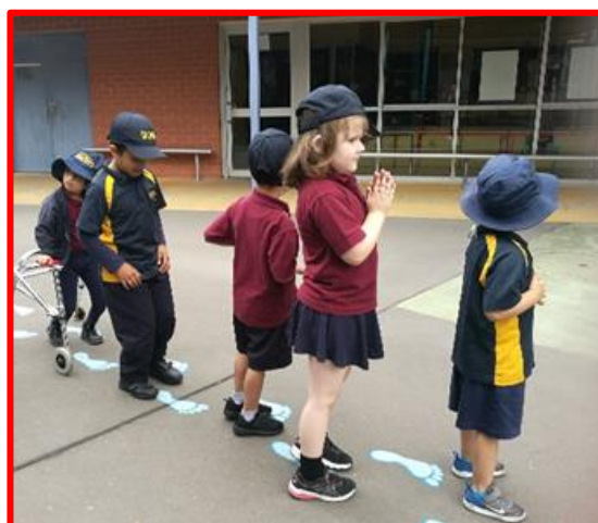
We walk in a line