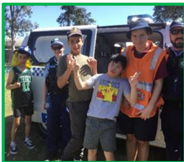
Students with police officers at the disco