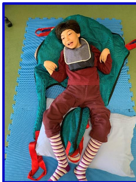
Meena on the foam mats stretching out her muscles.