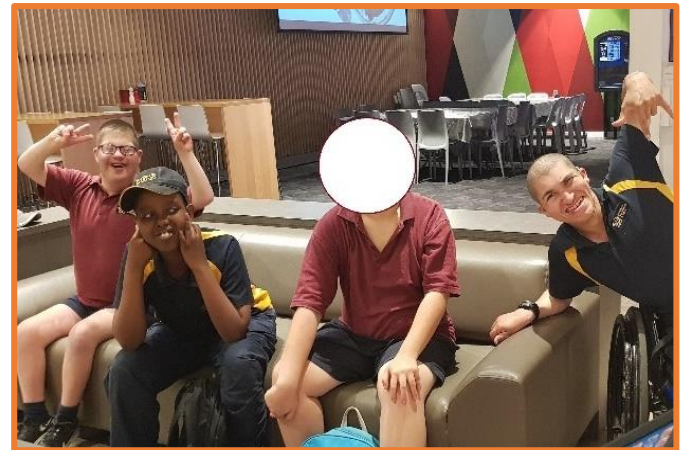
The boys at bowling