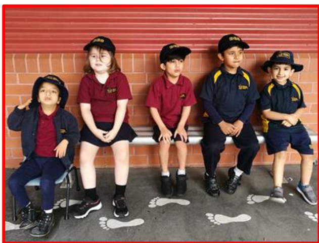
We stay with our group