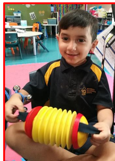
We keep play equipment low