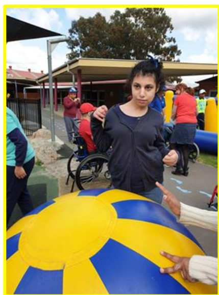
Bronaya participated during big ball game