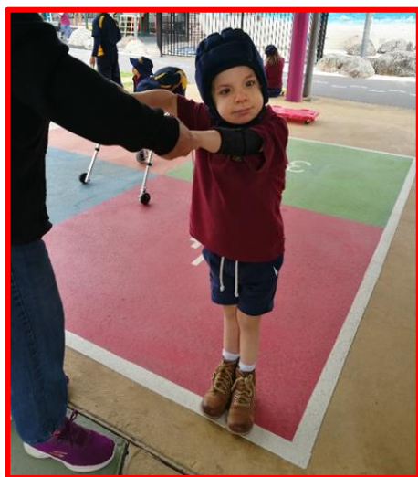
We wear our hats