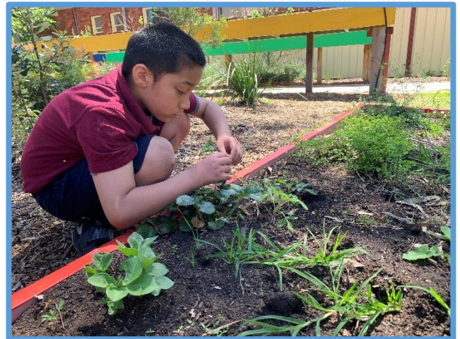
Morde enjoying harvesting strawberries to take back to the classroom to eat