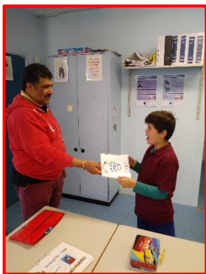
Dean using visuals to communicate