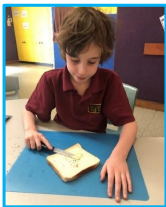
Jordan spreading margarine on bread