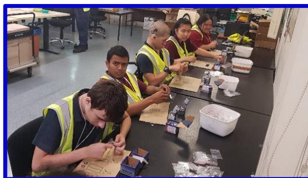
Our group at Centacare