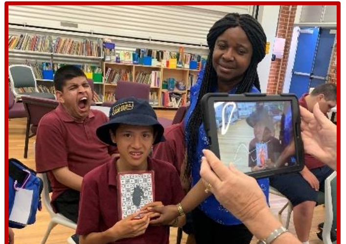
An holds up a visual of a heart which started beating when looking through the iPad