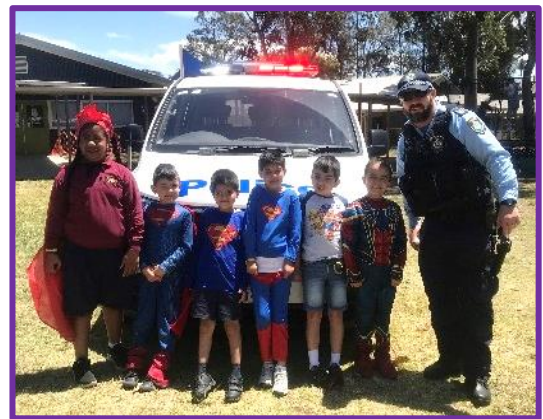
Some of Caterpillar Class posing with the police